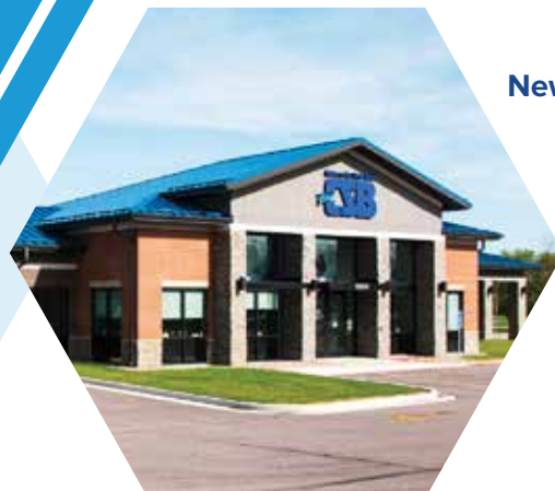
New Branch 2025